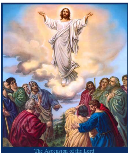
The Ascension of the Lord